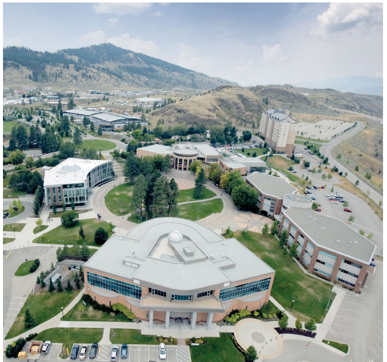
TRU Campus, located in the heart of Kamloops

For over 30 years, Thompson Rivers University (TRU) has been delivering customized training programs of the highest calibre, earning us worldwide recognition. Our intensive, short-term programs are strategically balanced to maximize learning opportunities while allowing participants enough time to gain an appreciation of Canadian culture and participate in carefully selected activities. The result is a rich and rewarding experience that will last a lifetime.