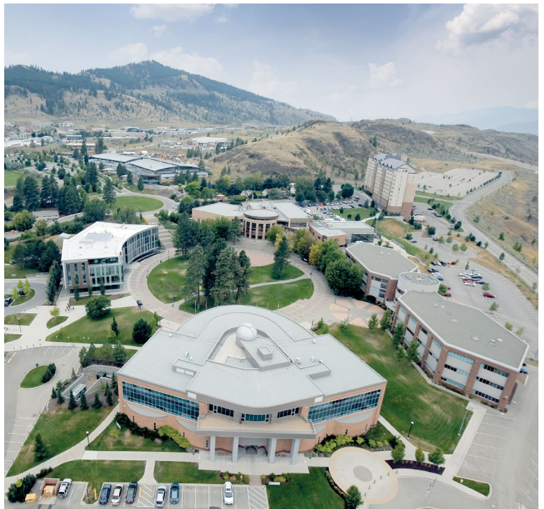
TRU Campus, located in the heart of Kamloops

For over 30 years, Thompson Rivers University (TRU) has been delivering customized training programs of the highest calibre, earning us worldwide recognition. Our intensive, short-term programs are strategically balanced to maximize learning opportunities while allowing participants enough time to gain an appreciation of Canadian culture and participate in carefully selected activities. The result is a rich and rewarding experience that will last a lifetime.